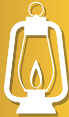
"Stack 'em Up Era"