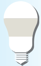
"The Renaissance Era"