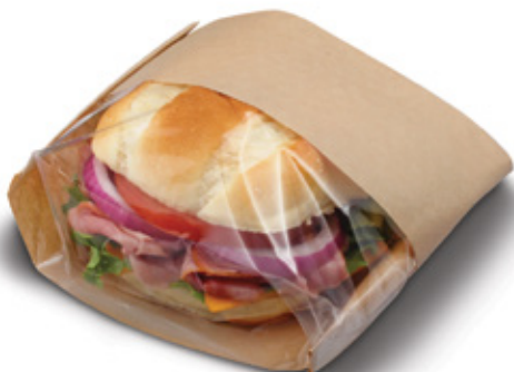
medium round sandwich