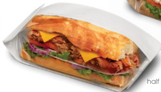
half size submarine