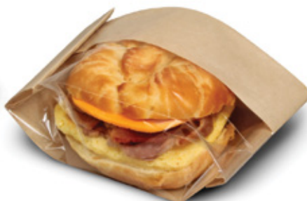
small round sandwich