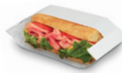
300082 (White) 300080 (Natural)