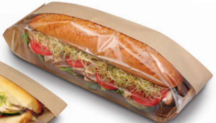
full size 12" submarine