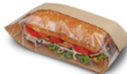
300097* (Natural) 300090 (Natural) 300092 (White)