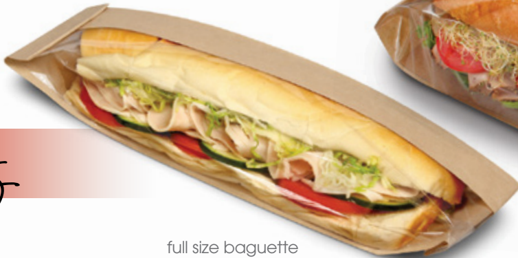
full size baguette