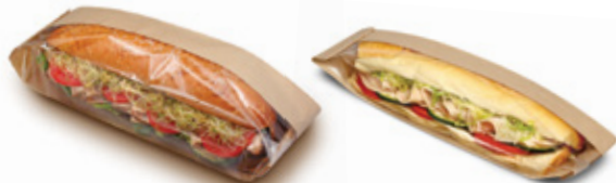
300098* (Natural) 300096 (Natural)