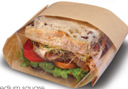
medium square sandwich