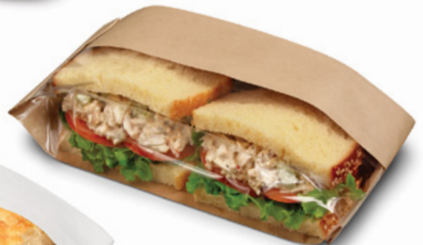
oblong sandwich halves