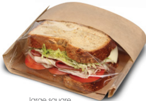
large square sandwich